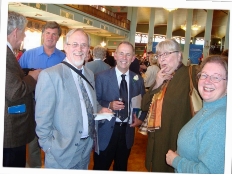
Right Photo: A gathering of B2B friends inside Government house.